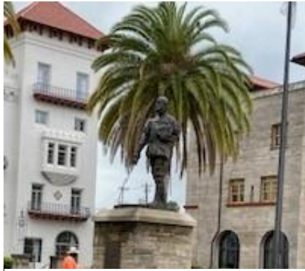
Statue of Ponce de Leon in St. Augustine, FL