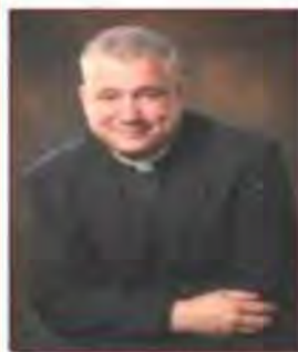
EWTN Radio Host, Author and Pastor from Erie, PA